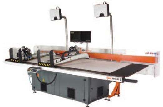
FlashCut Easy 888 L35