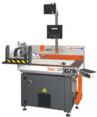
FlashCut Easy 222