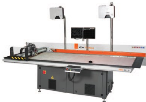
FlashCut Easy 888 L30